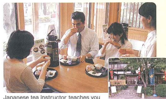
Japanese tea instructor teaches you the way to brew the delicious tea