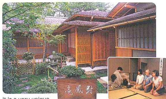
It is a very unique municipal tea ceremony house.