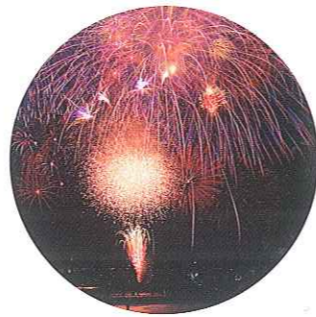
Uji River fireworks display to color a summer night of Uji